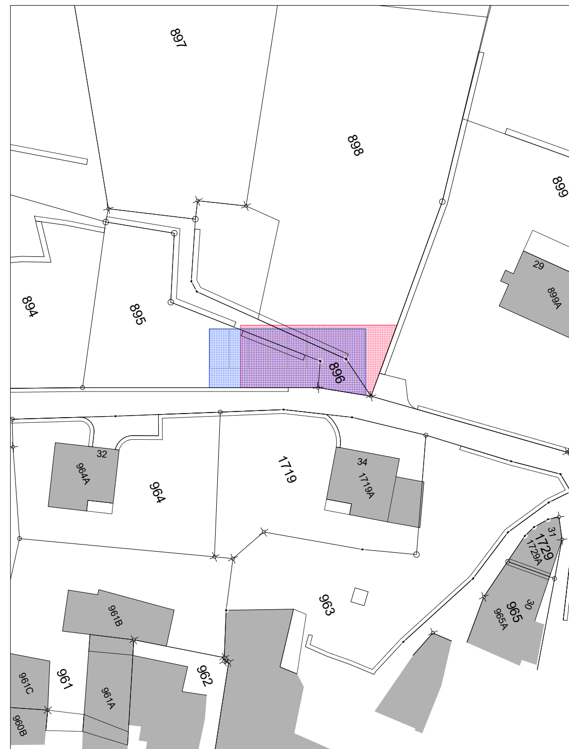
NUOVA DEFINIZIONE AREA P2/8